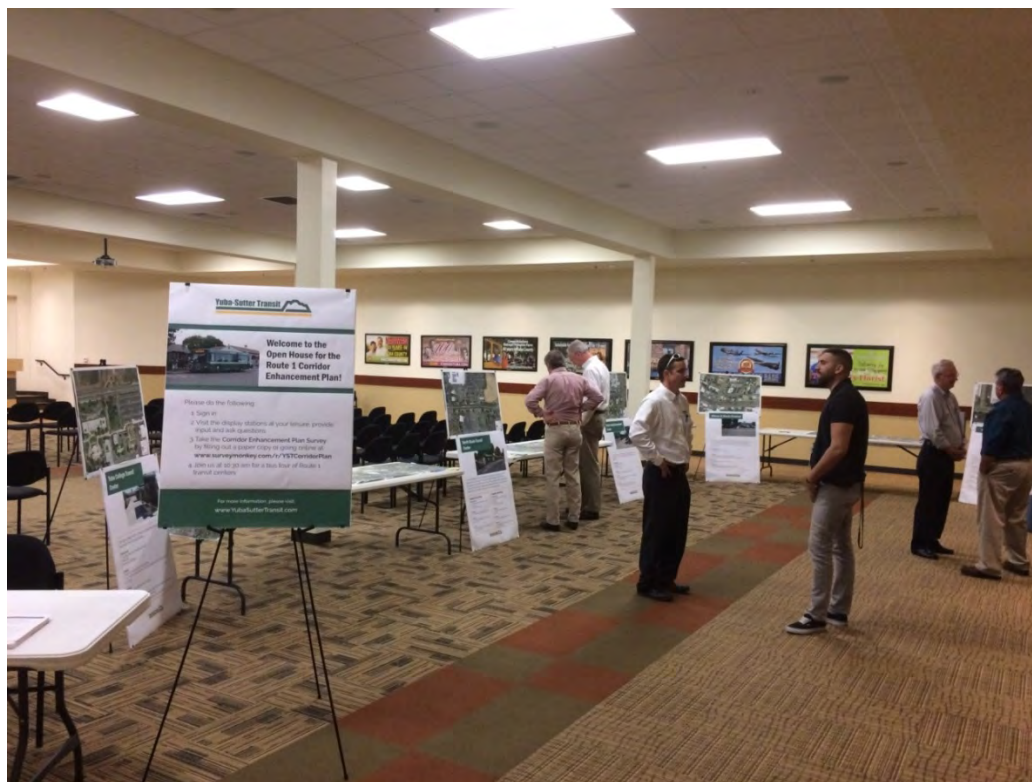
Community Workshop #1, September 20, 2017.